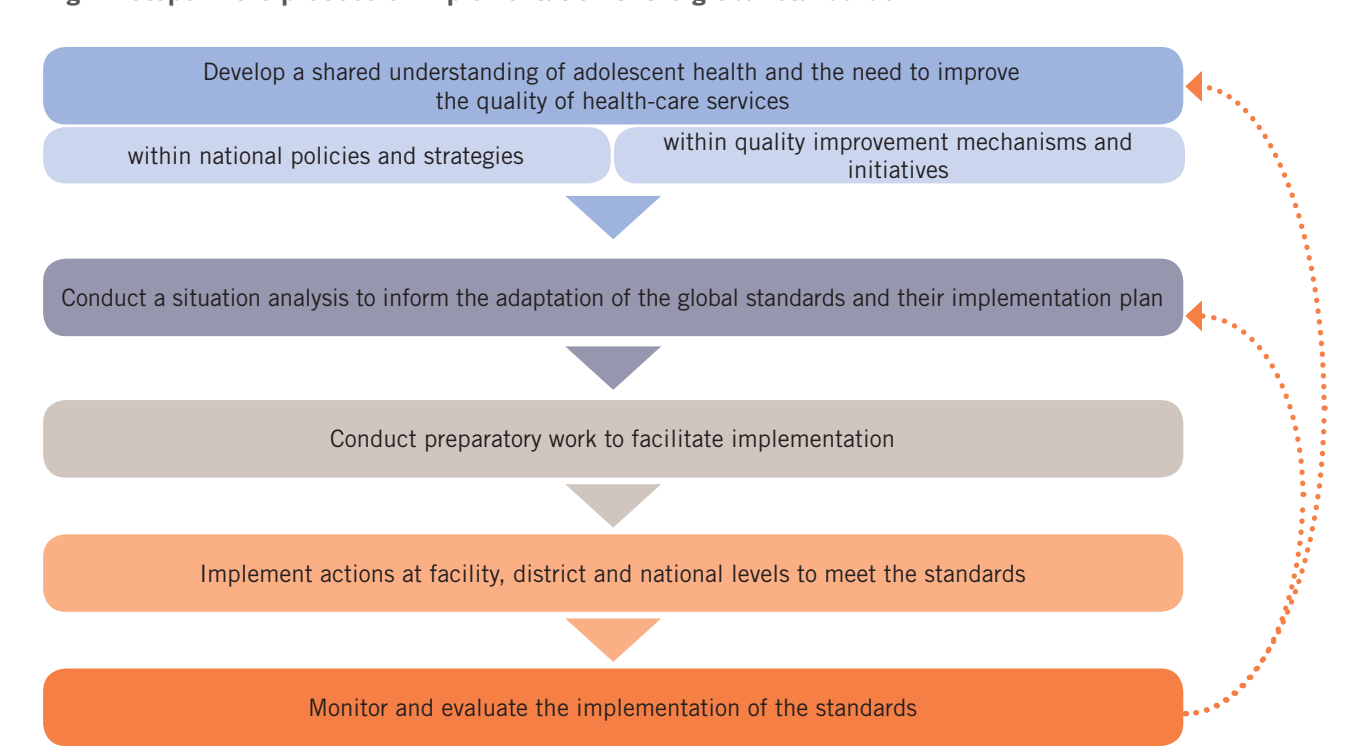
Fig. 1. Steps in the process of implementation of the global standards